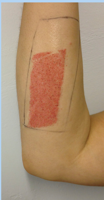
3. ADHERENCE TO SKIN

Physical Testing utilising human volunteers.