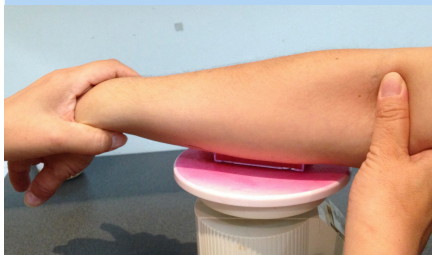
2. SAND IMPRESSION