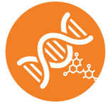
Hybrid seeds phenotyping, multiplication