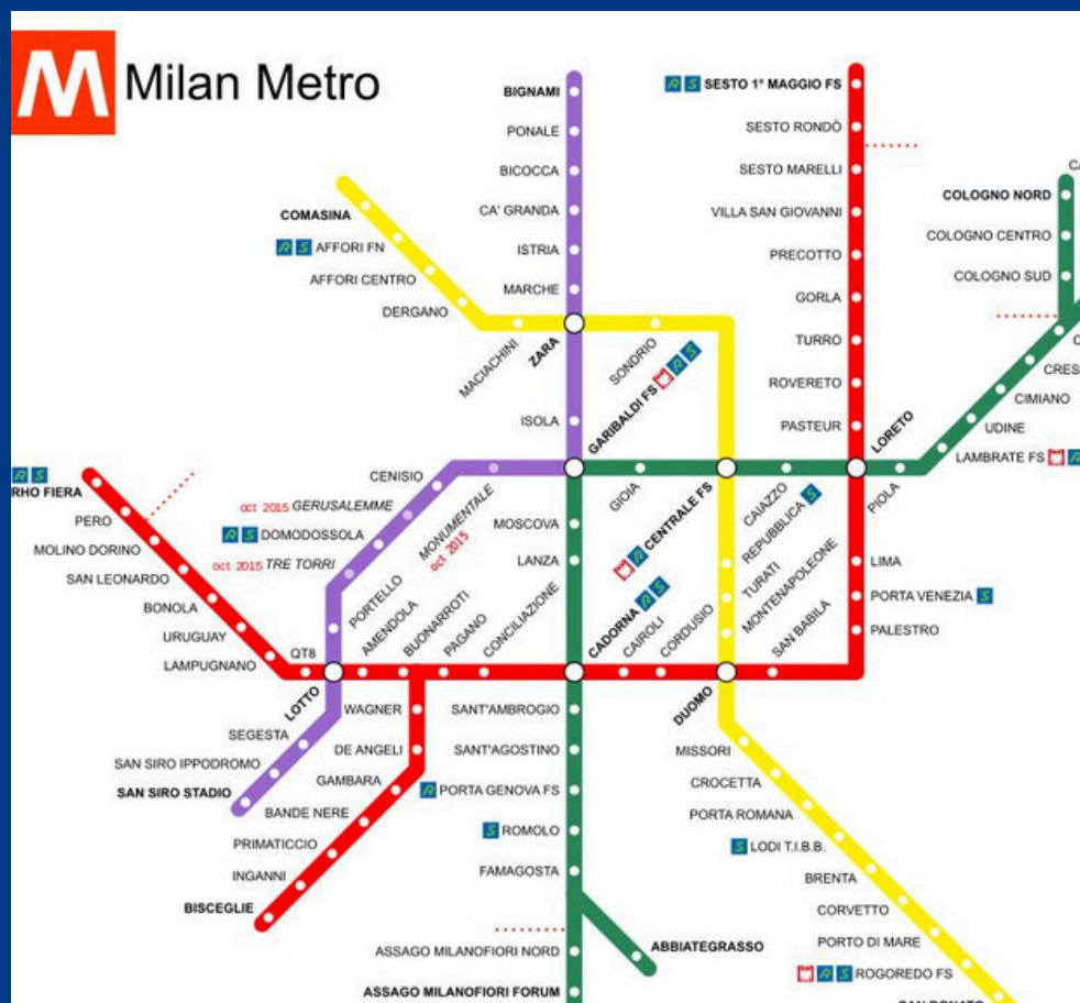
Milan Subway Map